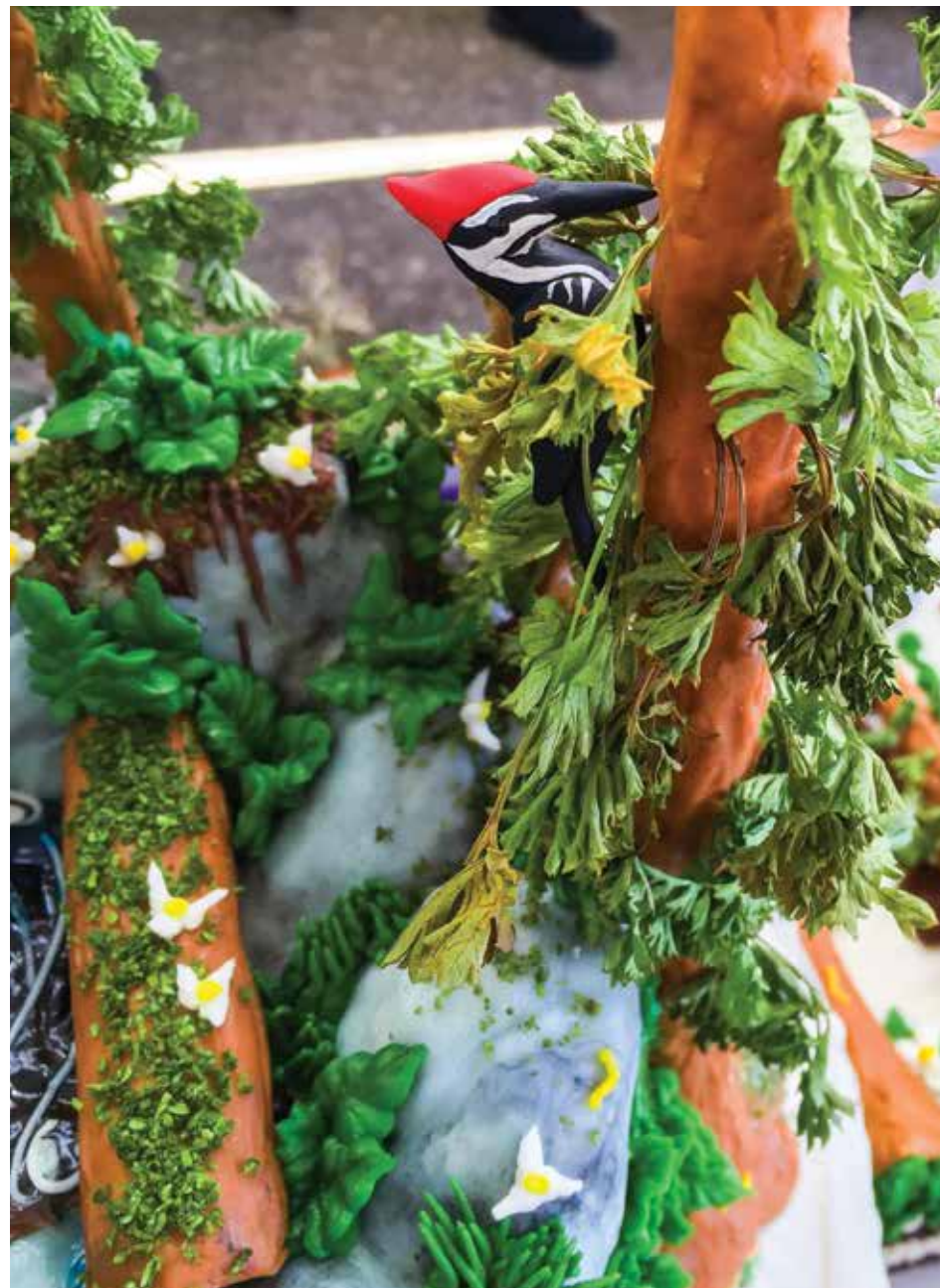
Close-up of the winning cake.