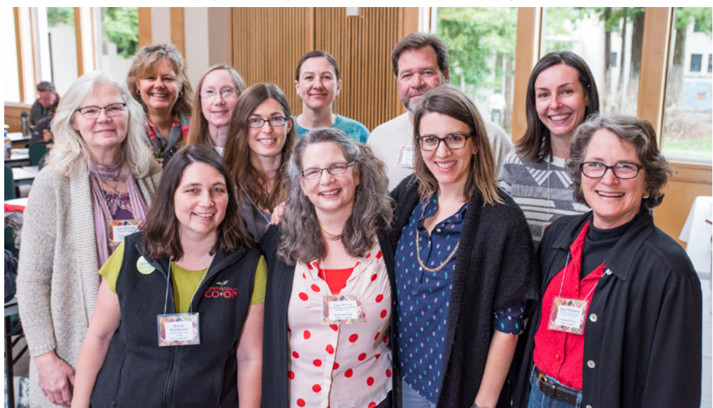
Special thanks to the Food Summit 2016 planning committee! These Humboldt Food Policy Council members spent the better part of a year designing, coordinating, and in some cases their organizations sponsored the event.