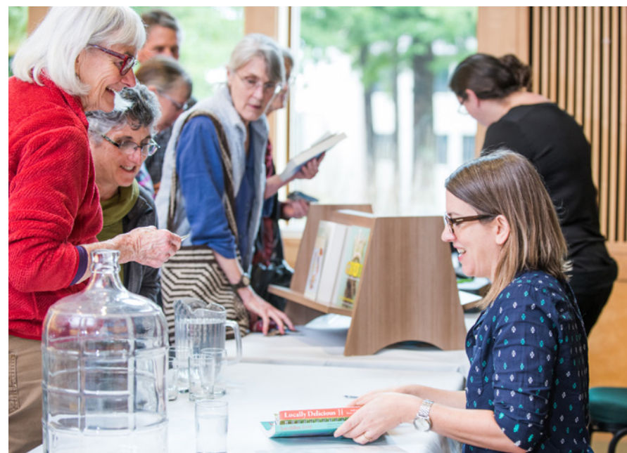
Keynote speaker and author Anna Lappé signs her books, as well as is introduced to Locally Delicious and Lunchbox Envy, two books written locally and published by North Coast Co-op.