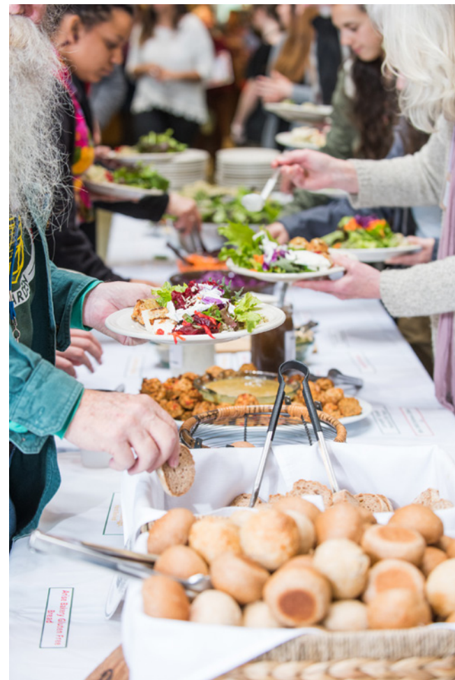
Participants enjoyed a fresh, healthy and local lunch with a focus on zero waste. Prepared and served by North Coast Co-op.

Food Summit 2016 was a resounding success! Thank you to our Prepared Foods Department (Deli & Bakery) for making the food for the day and our Outreach Department for coordinating and serving it! New Directions was there to help too. Feedback from participants follows two main themes: “the food was excellent!” and “The Co-op makes me proud to be a member!” Food Summit 2016 was hosted by the Humboldt Food Policy Council, of which the Co-op has been an active member for many years, and falls in line with our Strategic Plan goals of Developing Our Local Foodshed. Thank you to everyone who made the event possible! Many local vendors contributed fabulous food for the day, including Alexandre Farms, Arise Bakery, Beck’s Bakery, Cypress Grove Chevre, Drake’s Glen Chocolate, Dick Taylor Craft Chocolate, Earl’s Organic Produce, Little River Farms, and North Coast Co-op.